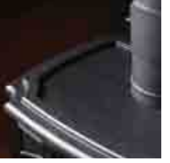
Its powerful presence is supported by a heat output approaching 9kW at an efficiency rate of 83%, one of the best around - one of the many reasons it's enormously popular.