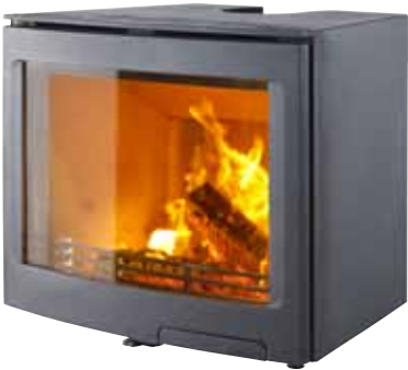
Contura i5 panorama door Contura i5 double doors

Bowed For installation in fireplace openings. Fits most open stoves. The handle is integrated in the door and the damper control is easily accessible on the front. Black or grey.