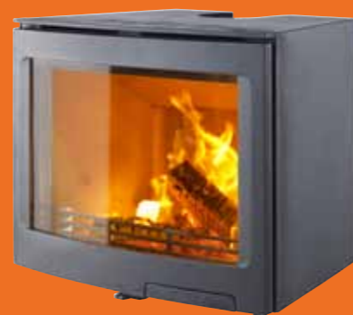
Contura i5, panorama door