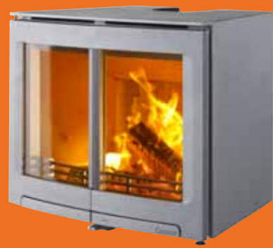
Contura i5, with double door

Upgrading an open fireplace with an insert is a wise decision. The heat spreads through the room instead of disappearing up the chimney. With the new, efficient combustion technology in Contura i5, the logs last longer and soot is minimised so that the fire is always visible through large, clean glass. Cosier, with a clear conscience: Contura i5 is the only Swedish Swan labelled cassette.